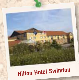
Hilton Hotel Swindon

Near the town centre this modern hotel has 171 comfortable rooms, a superb restaurant serving fresh, locally sourced ingredients and a health club with swimming pool, sauna and steam room.