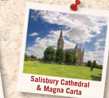
Salisbury Cathedral & Magna Carta

Explore this medieval masterpiece and view the iconic Magna Carta at your own pace, or take a tour to the base of Britain's tallest spire and view the beautiful water-meadows surrounding the Cathedral.