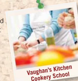
Vaughan's Kitchen Cookery School

For other inspirational food and drink ideas go to visitwiltshire.co.uk/food-and-drink