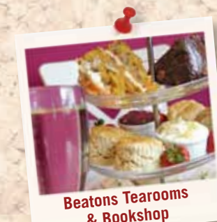
Beaton's Tearooms & Bookshop

Tel: 01380 530203 www.vaughanskitchen.co.uk