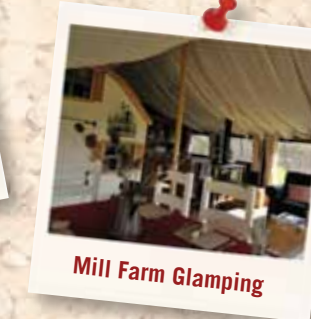
Mill Farm Glamping

Tel: 01722 716334 www.marshwoodfarm.co.uk