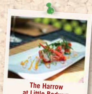
The Harrow at Little Bedwyn

Tel: 01747 871819 www.beatonstearooms.co.uk