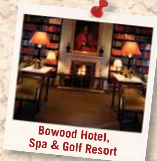
Bowood Hotel, Spa & Golf Resort

Tel: 01793 881777 www.swindon.hilton.com