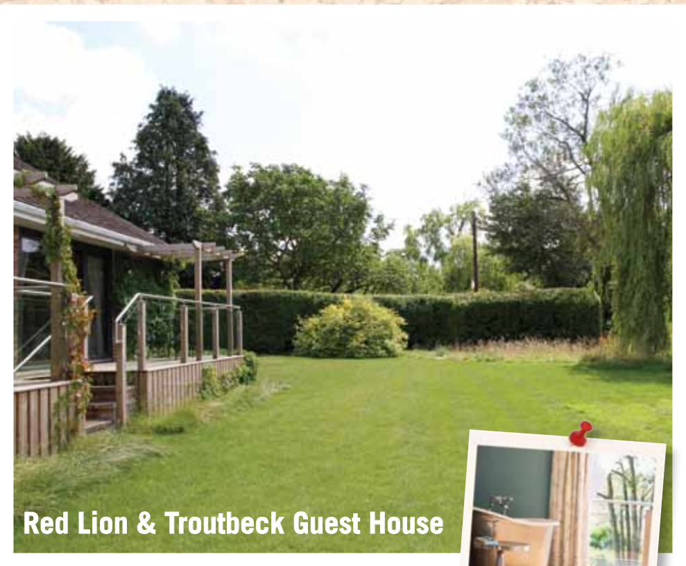
Red Lion & Troutbeck Guest House