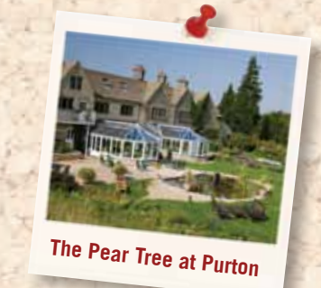
The Pear Tree at Purton

Tel: 01380 828351 www.millfarmglamping.co.uk