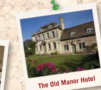
The Old Manor Hotel

Tel: 01225 703377 www.vintage-classics.co.uk