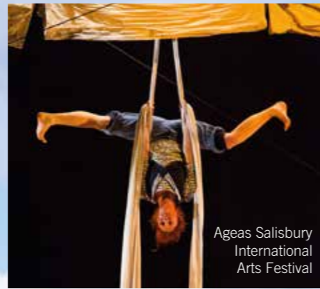
Ageas Salisbury International Arts Festival